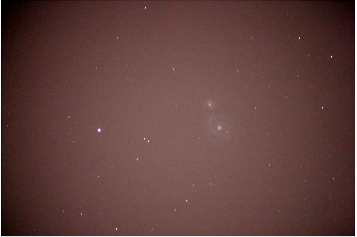
Digital Rebel – ISO 1600 / 1 X 120 sec exp unguided / Meade LX-90 8”SCT / UV filter / 6.3 Focal Reducer